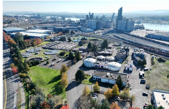
Wastewater Solids Renewal