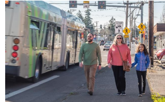
Transportation System Improvements