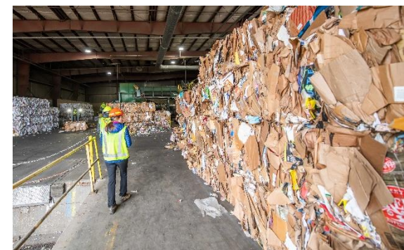
Solid Waste Management