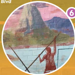
6 Pierre Bombardier (2018) Best Cabinet & Granite Supply 3001 E Fourth Plain Blvd East wall