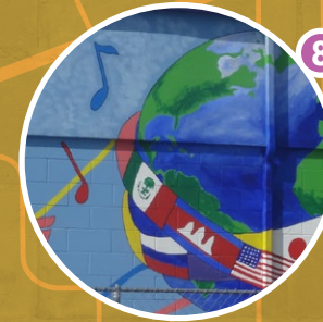
8 Christian Barrios (2017) International Plaza 6000 NE Fourth Plain Blvd East wall