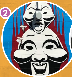
FABS, CD Valdes, K-Choy (2018) Melodies Salon 2415 E Fourth Plain Blvd West wall