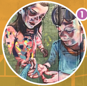
1 FABS (2017, 2018) Evergreen Floors & Doors 2504 E Fourth Plain Blvd West wall New mural planned for summer 2019 at Evergreen Floors & Doors