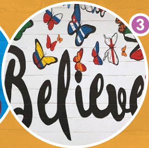
3 Christian Barrios (2018) Melodies Salon 2415 E Fourth Plain Blvd East wall