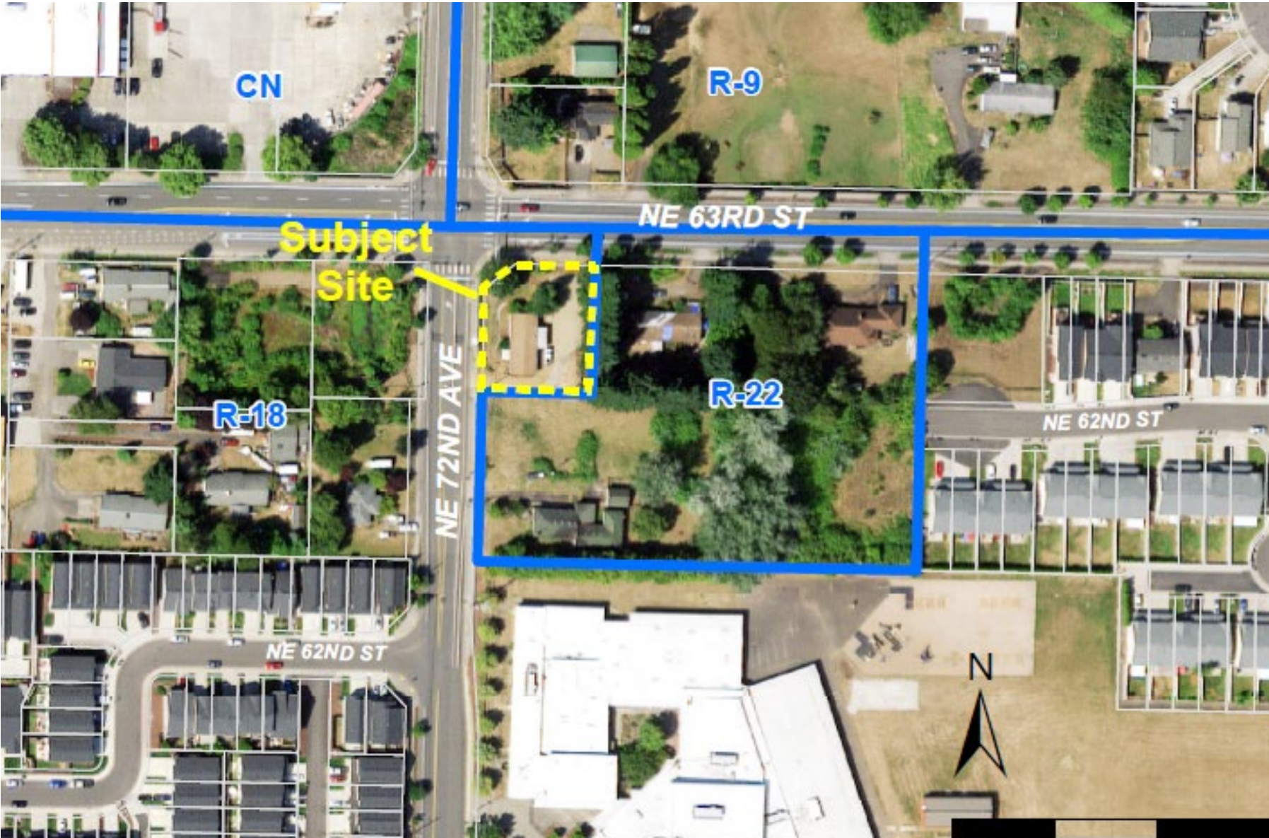
62 nd Avenue Apartments corner rezone— 3