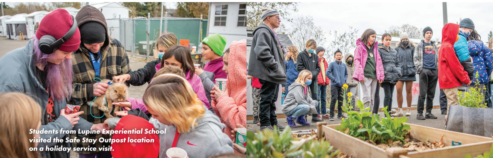
Students from Lupine Experiential School visited the Safe Stay Outpost location on a holiday service visit.

Including Evergreen Memorial Gardens, Talkin' Trash, YMCA and Outsiders Inn